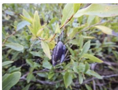
Fruit and leafy stems. Photographer CathB, Canberra, ACT