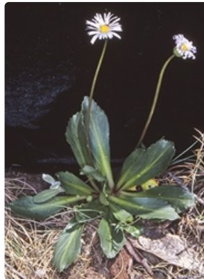
Flowering plant. Namadji National Park, ACT