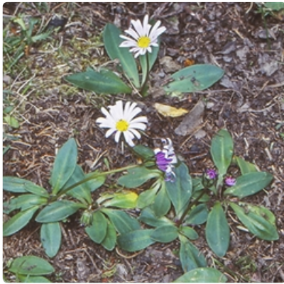
Flowering plants. Coolumboka Nature Reserve near Bombala