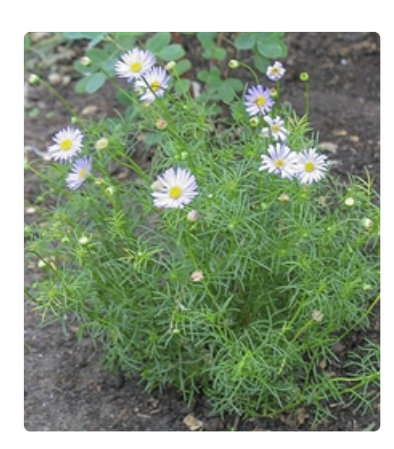
Flowering plants.