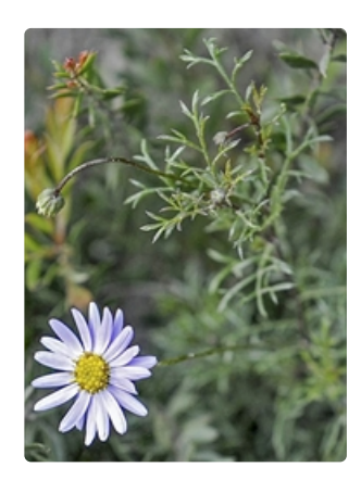
Flower head and leaves. north of Melbourne, Vic