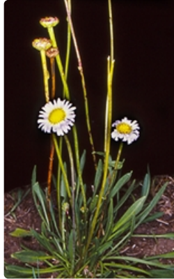
Flowering plant. Namadji National Park, ACT