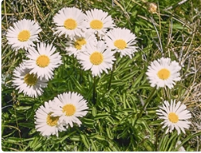
Flowering plants. Kosciuszko National Park