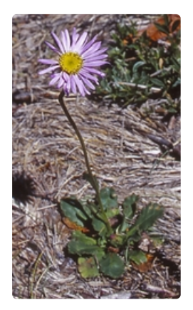
Flow ering plant. Namadgi National Park, ACT