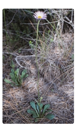
Rowering plant. Ben Boyd National Park south of Eden