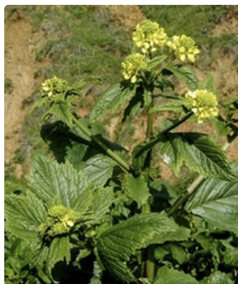
Flowering stems.