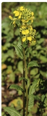
Flowering stem.