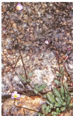
Flowering plant. Mt Tennent, ACT