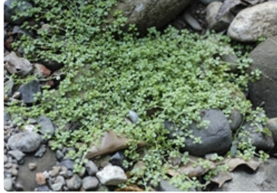
Carpet. Australian Plant Image Index, photographer Murray Fagg, Monga National Park