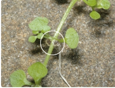
Flowering stem (paired flowers circled). Monga National Park