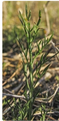
Leaves.