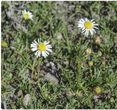
Flowering plants. Australian Plant Image Index, photographer Murray Fagg, Nadgigomar Nature Reserve north of Braidwood