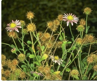
Flower heads and spent flower heads on leafy stems.