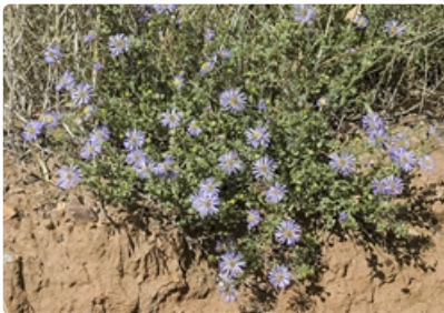
Flowering plant. near West Wyalong