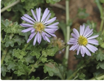
Flower heads and leaves. Weddin Mountains National Park near Grenfell