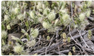
Flowering plants.