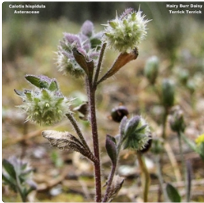
Flowering stems. Terrick Terrick, Vic