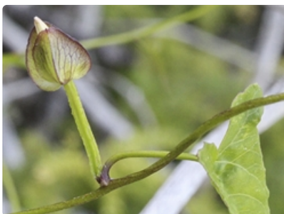
Flower bud showing bracteole, and leaf.