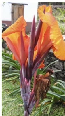
Flowering stem. unknown place