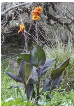
Flowering plant. Tuggerah Lake