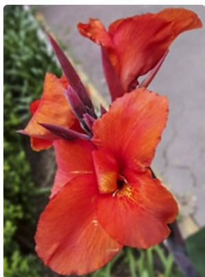
Flowers. unknown place