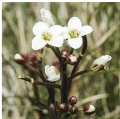
Flowers. Kosciuszko National Park