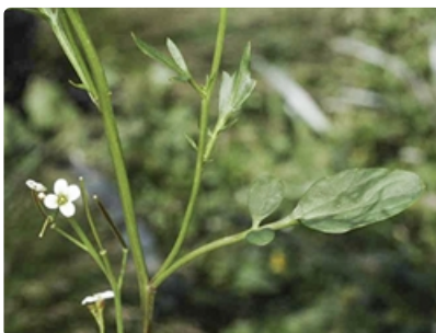
Flowers and leafy stem. Bogong High Plains, Vic