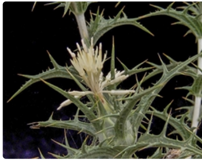
Flowering stem. Scotia Sanctuary, western NSW