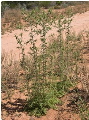
Plants. Scotia Sanctuary, western NSW