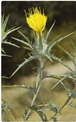
Flowering stem. Bungonia, east of Goulburn