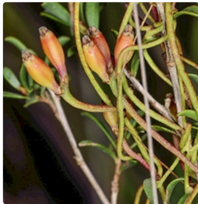
Fruit ( f. dispar). Brisbane Ranges National Park, Vic