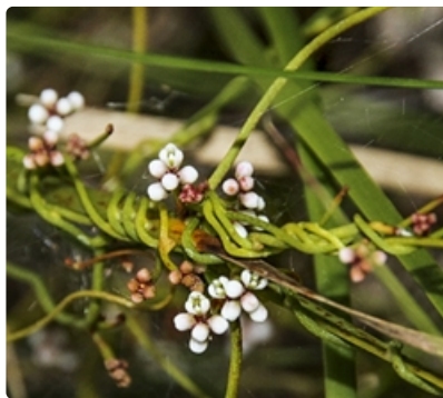
Flowering stems ( f. dispar ). east of Macedon, Vic