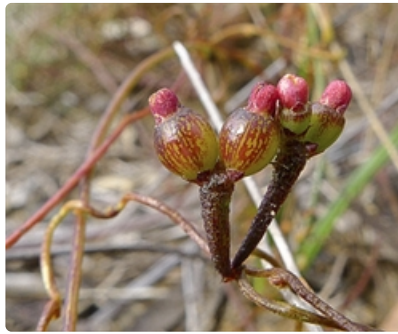
Fruit ( f. glabella). Royal National Park, Sydney