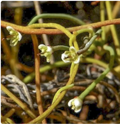
Flowering stems ( f. glabella ). near Murrumbidgee