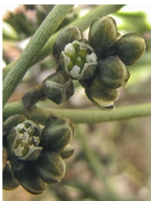
Flowers.