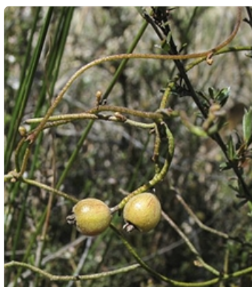
Fruit on stems.