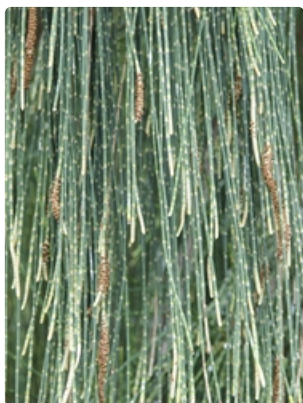
Male flowers on stems. Midway Atoll