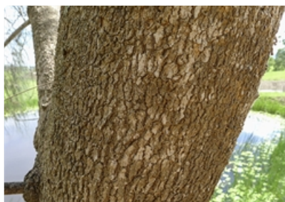
Trunk. Turners Flat near Kempsey