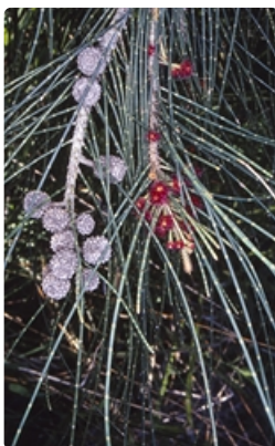
Female flowers and mature cones. Potato Point east of Bodalla