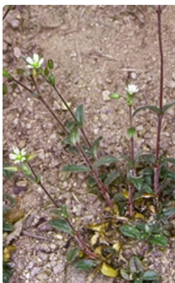
Flowering plant. Tallaganda State Forest west of Braidwood