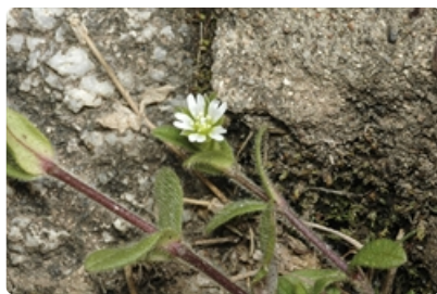
Flowering stem. Kosciuszko National Park