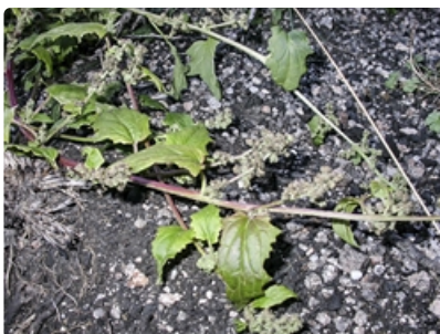
Flowering stems.