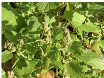
Leaves, flowers, and young seed cases.