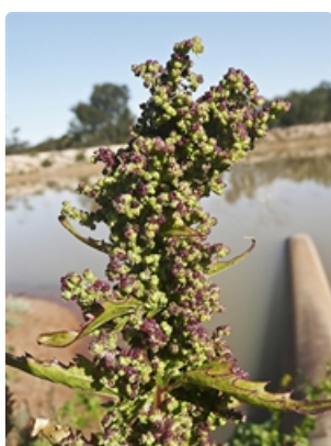
Stem with seed cases. Photographer Don Wood, Scotia Sanctuary, western NSW