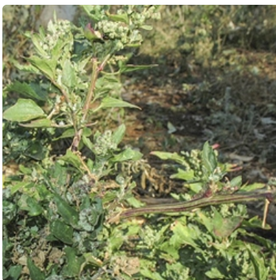
Stems with flower buds.