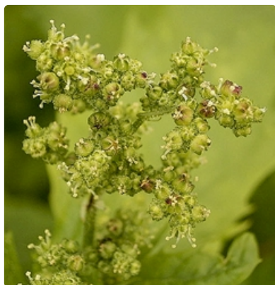
Flowers. Canary Islands, Africa