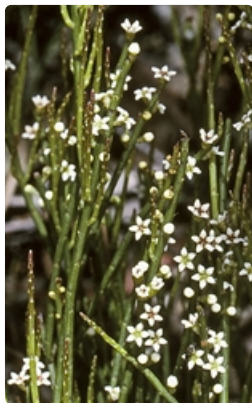
Flowering stems. Wadbilliga National Park