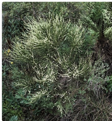
Shrub. Carrington Falls, near Robertson