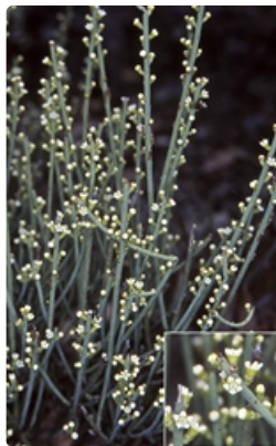
Flowering stems. Black Mountain, Canberra, ACT