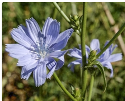
Flower heads. Batlow-Tumbarumba Road