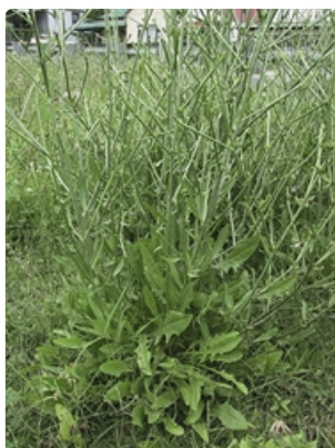
Base of plant.