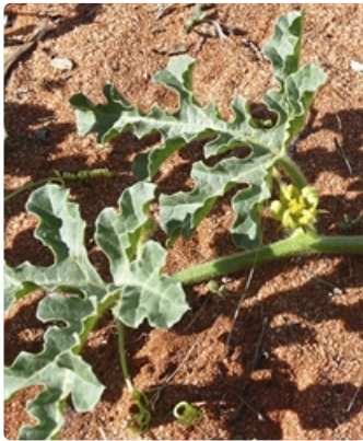
Flower and leaves. Scotia Sanctuary, western NSW