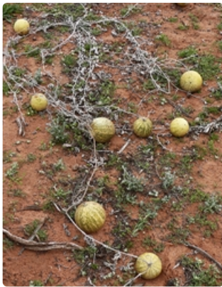
Ripe melons. Scotia Sanctuary, western NSW