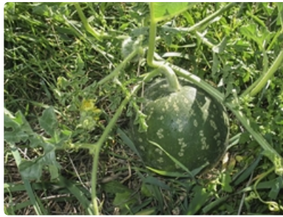
Melon.