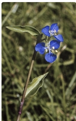
Flowering stem.