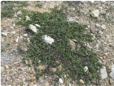
Plant. near Nerriga