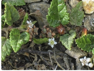
Flowers, spent flowers, and leaves. near Nerriga