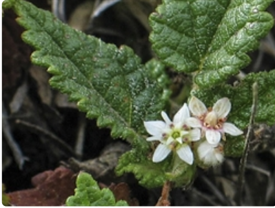
Flowers and leaves. Photographer Jackie Mles, near Nerriga