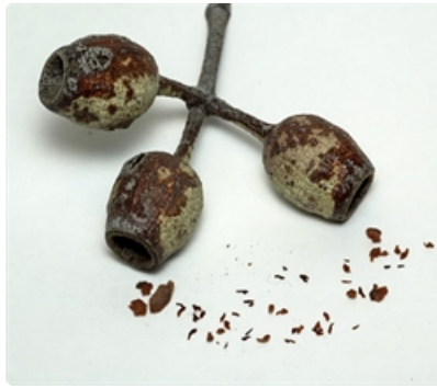
Gummuts and seeds.