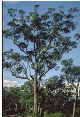
Tree. Australian Plant Image Index, photographer Denise Grieg, East Kurrajong