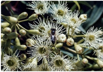
Flowers and buds.