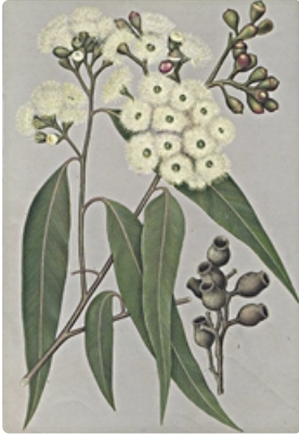
Painting from EMinchin Flowers and Ferns of New South Wales (1897)