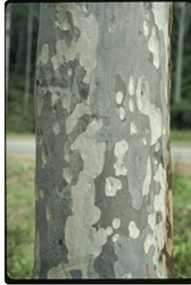
Bark. Australian Plant Image Index, photographers Brooker & Kleinig, north of Batemans Bay