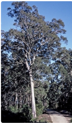
Tree. Australian Plant Image Index, Photographer IG Halliday, Narooma