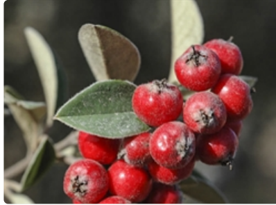
Fruiting stem.