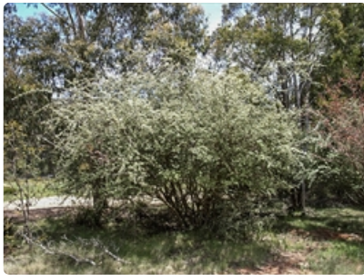
Flowering shrub. Tallaganda State Forest south of Braidwood