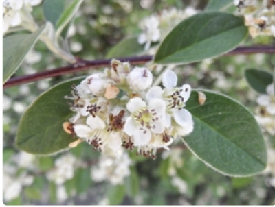
Flowers and leaves.