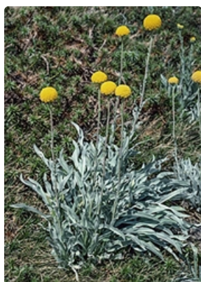
Flowering plants. Australian Plant Image Index, photographer Murray Fagg, Kosciuszko National Park