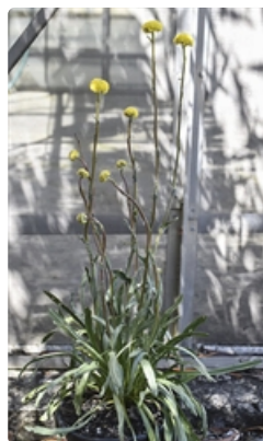
Flowering plant.