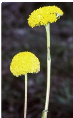
Flower heads. near Mallacoota, Vic