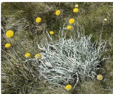
Flowering plants. Bogong High Plains, Vic