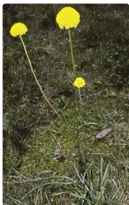
Flowering plants. Badja State Forest NE of Cooma