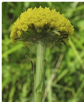
Flower head.