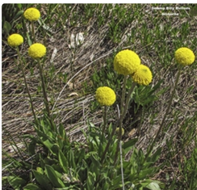
Flowering plants.