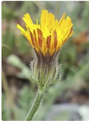
Partially open flower head.