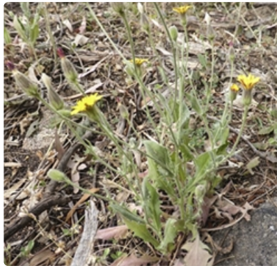
Flowering plant. Photographer Mke Sim, Canberra, ACT