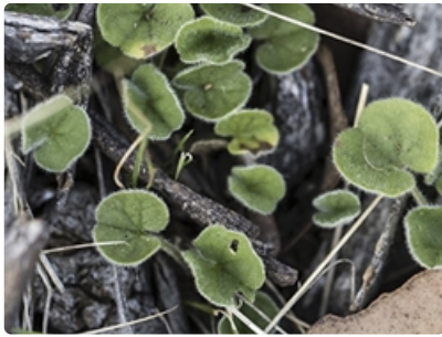
Leaves. Photographer illilinga, south of Michelago