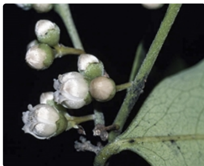
Male flowers.