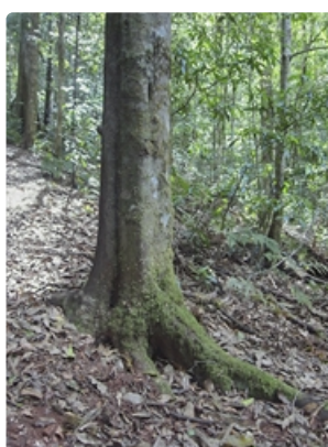
Lower trunk. Australian Plant Image Index, photographer Murray Fagg, Tappin Tops National Park, SW of Port Macquarie