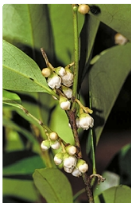
Male flowers and leaves. Australian Plant Image Index Australian Tropical Rainforest Plants Key, photographer unknown