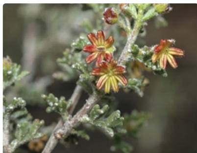
Flowering stems (male). Yass-Wee Jasper Road