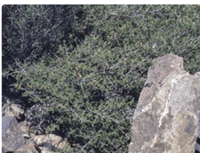
Shrub. Warrumbungle Ranges west of Coonabarabran