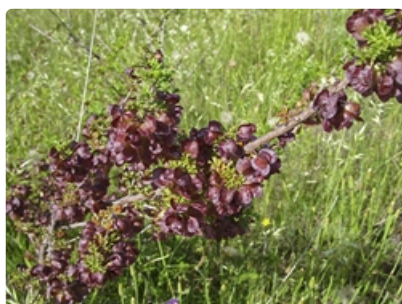
Stem with seed cases. Illunie Nature Reserve south of Cowra