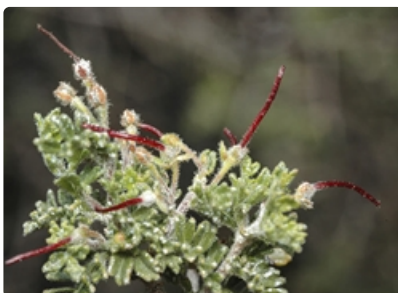
Flowering stems (female). Yass-Wee Jasper Road