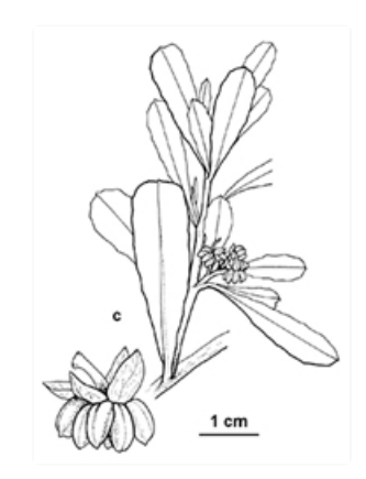
Line drawings (subsp. cuneata ). c. leaves and male flowers. MMbir, National Herbariumof Victoria, © 2021 Royal Botanic Gardens Board