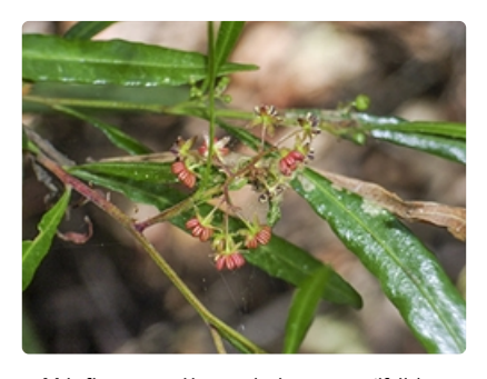
Male flow ers and leaves (subsp. angustifolia ). near Mallacoota, Vic