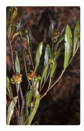
Male flowers and leaves (subsp. spatulata ). Photographer Don Wood, Bungonia State Conservation Area east of Goulburn