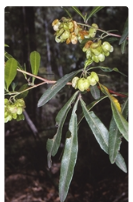
Young seed cases and leaves (subsp. spatulata ). Nullica State Forest west of Eden.