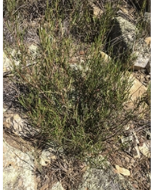
Shrub. Photographer Alex Watt, Lake Googong east of the ACT