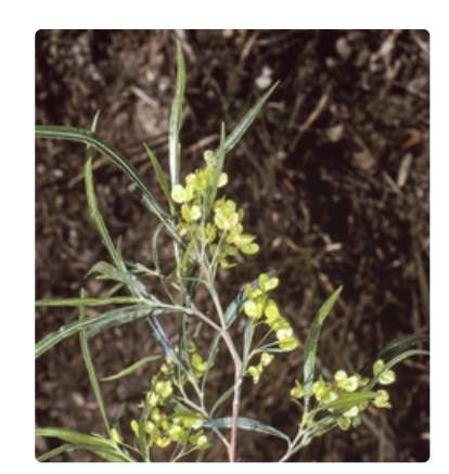
Leafy stems with young seed cases (subsp. angustifolia). Boyne State Forest north of Batemans Bay