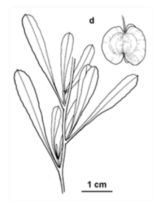
Line drawings (subsp. spatulata ). a. leaves and seed case. MMbir, National Herbarium of Victoria, © 2021 Royal Botanic Gardens Board