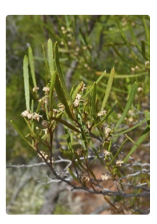
Male flowers and leaves (subsp. angustissima ). Scotia Sanctuary, western NSW