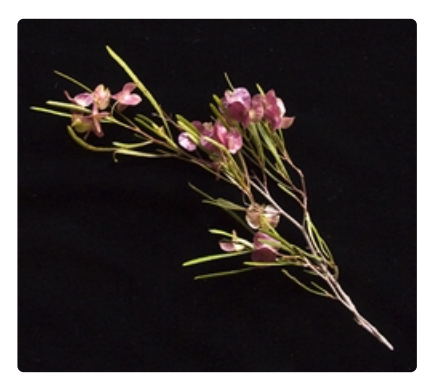
Leafy stemwith ripe seed cases (subsp. angustissima). Photographer Don Wood, Scotia Sanctuary, western NSW