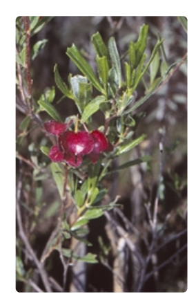
Ripe seed cases and leaves (subsp. cuneata ). Photographer Don Wood, Black Mountain, Canberra