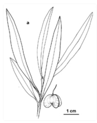
Line drawings (subsp. angustifolia ). a. leaves and seed case. MMbir, National Herbariumof Victoria, © 2021 Royal Botanic Gardens Board