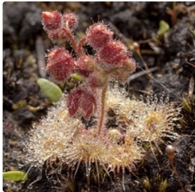
Plant with flower buds.