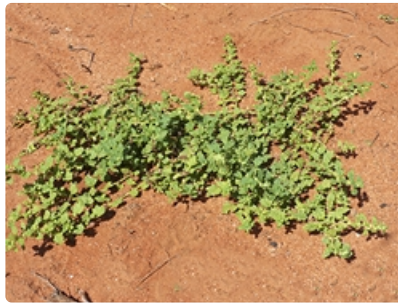
Plant. Scotia Sanctuary, western NSW