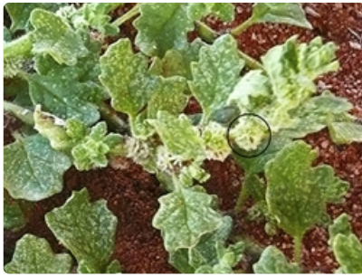
Leafy stems with seed cases. Scotia Sanctuary, western NSW