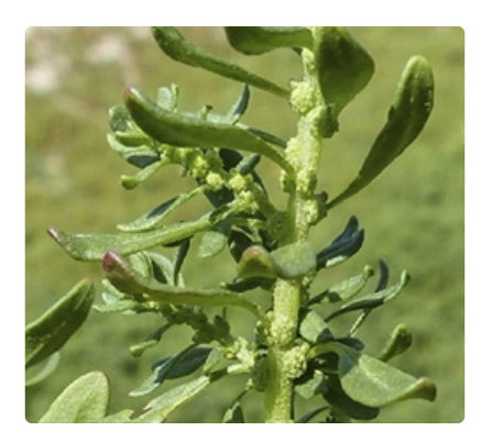
Rowering and seeding stem