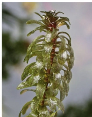
Leafy stem.