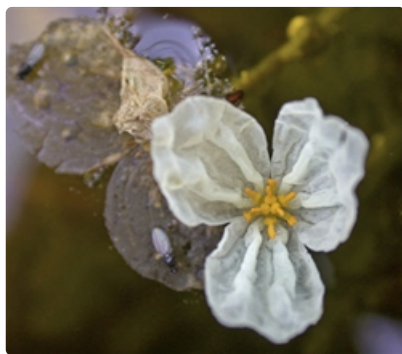
Male flower. unknown place