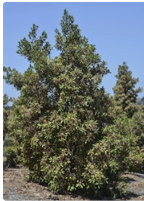
Tree. Australian Plant Image Index, photographer Murray Fagg, Royal Botanic Gardens Mt Annan, near Campbelltown