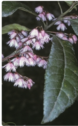
Flowering stem. Bangalee Reserve west of Nowra