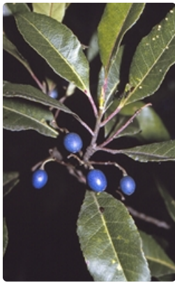
Fruiting stem. Booderee National Park, Jervis Bay Territory