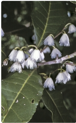
Flowering stem. Booderee National Park, Jervis Bay Territory