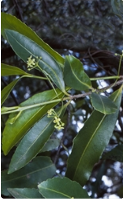
Flowering stem. Boyne State Forest NW of Batemans Bay