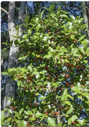
Fruiting branches. garden, Coffs Harbour