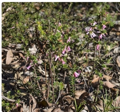
Shrub. SE Forests National Park