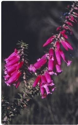
Flowering stems. Photographer Don Wood, Ben Boyd National Park south of Eden