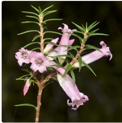
Flowering stem. Nungatta State Forest north of Eden