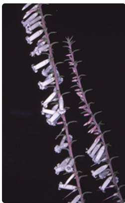
Flowering stems. Nadgee State Forest south of Eden