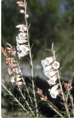
Flowering stems.