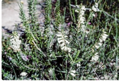
Flowering shrub. Kuringai Chase National Park, Sydney