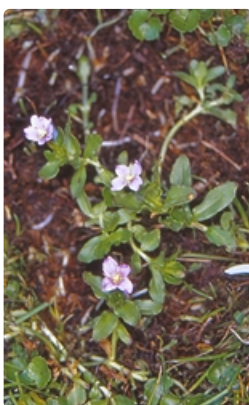
Flowering plant. Namadgi National Park