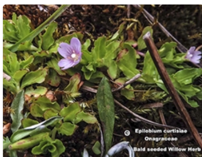
Flowering stems. Bogong High Plains, Vic