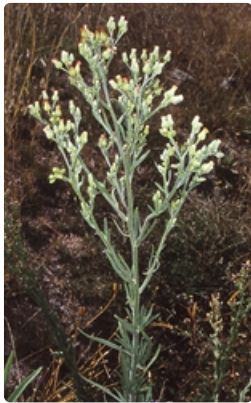
Flowering stem. Tidbinbilla Nature Reserve, ACT