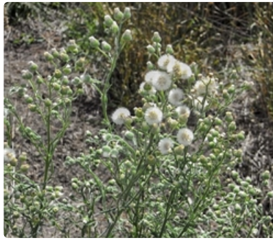
Flowering and seeding stems.