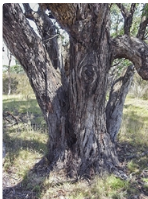
Trunk. Braidwood to Cooma