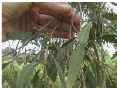
Leaves and flower buds. Laggan Travelling Stock Route near Crookwell