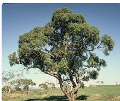
Tree. unknown place