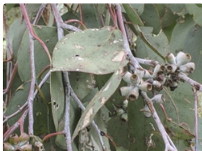
Gumnuts and leaves. South Gundagai cemetery