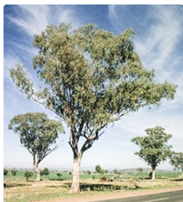
Tree. Australian Plant Image Index, photographers Brooker & Kleinig, unknown place