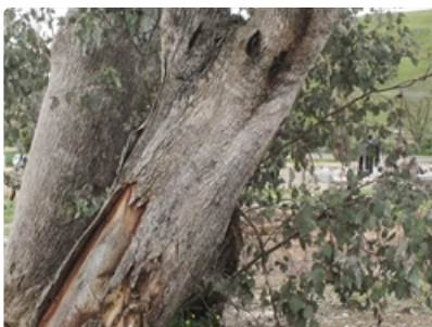
Trunks. South Gundagai cemetery